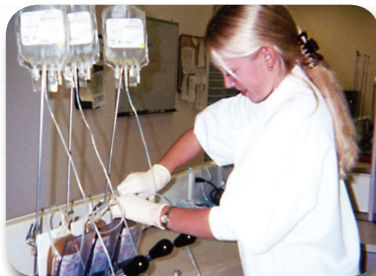
Each unit of blood is subjected to more than 18 hours of processing and testing in our lab.

Under our program, the processing fees insurance companies don't reimburse, Florida Blood Services will. We reimburse all processing fees, up to $5,000 per patient/per rolling calendar year, even if a patient does not have insurance. Our program does not pay hospitalization costs, but covers processing fees for transfusions received at any hospital in the United States.